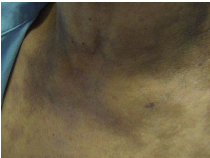
Figure 1. Symmetric hyperpigmented oval brown patches on the neck and upper trunk of a 51-year-old Hispanic female.

Direct immunofluorescence showing colloid IgM suggests a diagnosis of ashy dermatosis [18]. The presence of cutaneous lymphocyte antigen positive cells in the basement membrane zone suggests that ashy dermatosis can be a response to antigenic stimulation [19]. There is excess expression of intercellular adhesion molecule 1 and HLA-DR in the