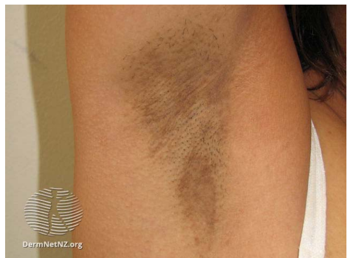
Figure 2. Hyperpigmented macules that have coalesced into a large patch in the axilla of a patient.